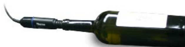
Thermo Scientific™ Orion™ Optical DO Sensor