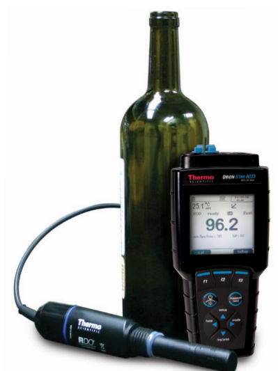
Thermo Scientific™ Orion Star™ A223 Dissolved Oxygen Portable Meter Kit

To purchase an Orion Star A223 DO Portable Meter, Orion Optical DO Sensor and other related products, please contact your local equipment distributor and reference the part numbers listed below.