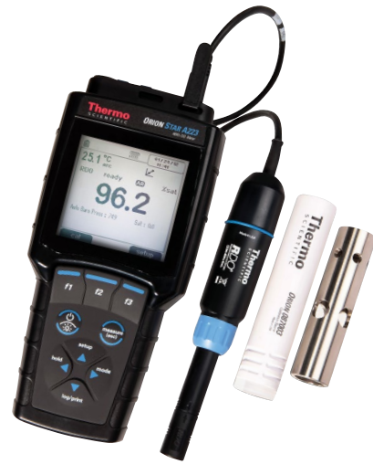
Thermo Scientific™ Orion Star™ A223 Dissolved Oxygen Portable Meter Kit