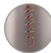
Embossing on skirt/head with or without printing