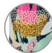
4-color (CMYK) printing