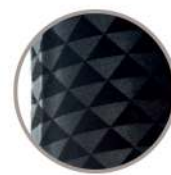
Tone on tone