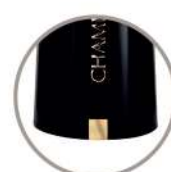
UV spot to align your label with your hood design