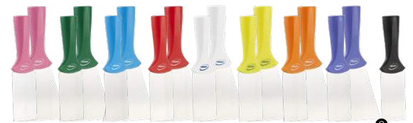
Pink Green Blue Red White Yellow Orange Purple Black