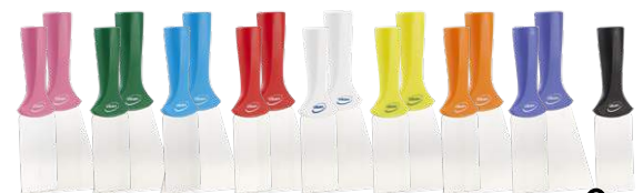
Pink Green Blue Red White Yellow Orange Purple Black