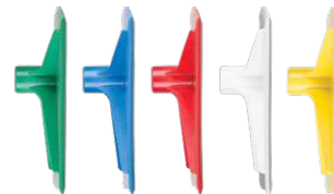
Green Blue Red White Yellow