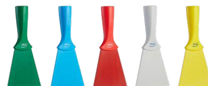
Green Blue Red White Yellow

Denotes product is made of FDA compliant materials.