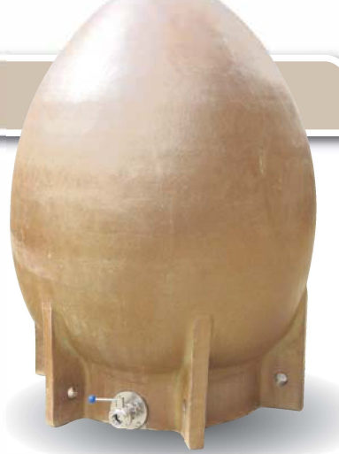
Total Drain Valve

Stainless steel valve, Silicone bung with glass fermentation breather and stainless steel base