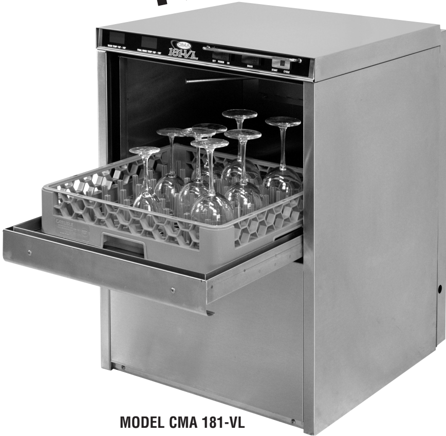
MODEL CMA 181-VL